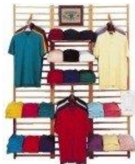
Clothing Master Rhonda Ito