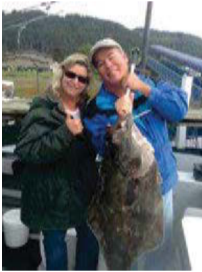
VP Norm Campbell