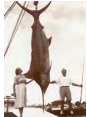
Weigh Master Curt Itogawa