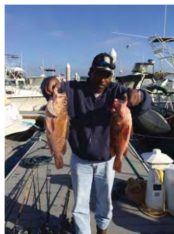
4lb & 4.5 lb Reds