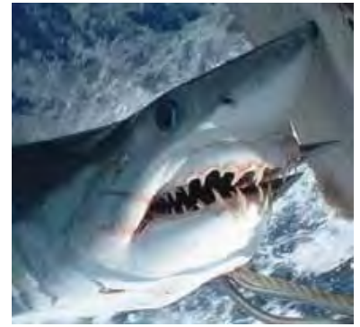
Tournament Master: Rolly Lira