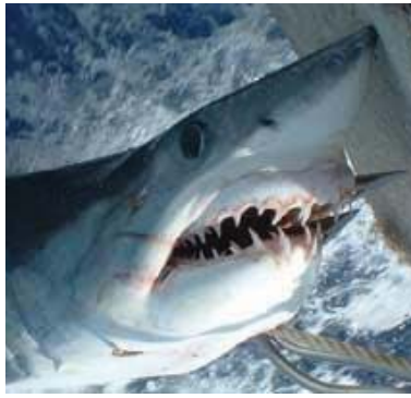
Tournament Master: Lee Fleming