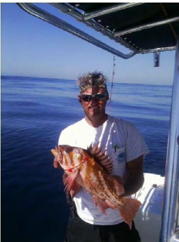
Fox with a nice Chuckle Head