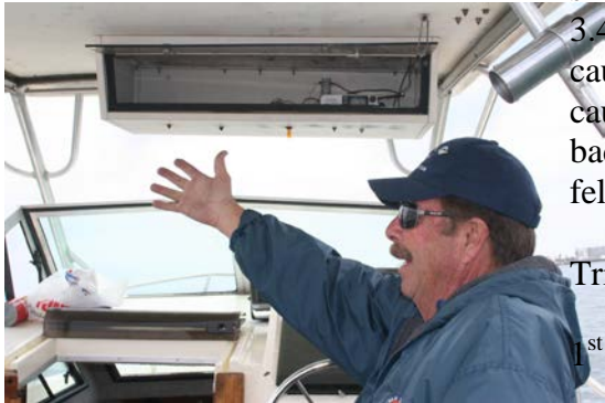
"Where the Heck are all the FISH?"