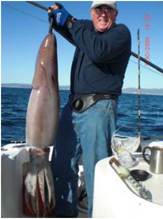
PR: Tim Foote