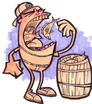
Raffle Master Robert Watson

Yearbook advertizing rates: Back Cover Full Page in Color: $500 Inside Cover Full Page B& W: $300 Full Page in B&W: $200 Half Page: $100 Quarter Page: $50 (business card)