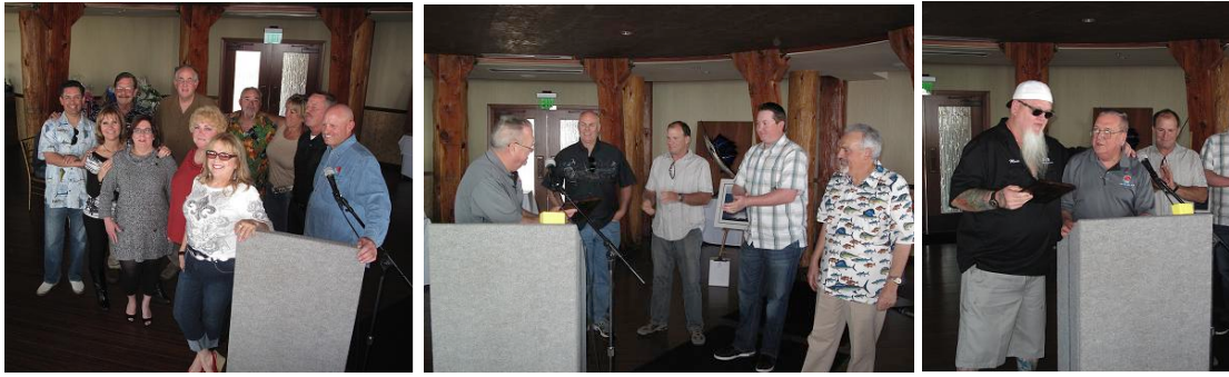
New Board (& the editor) Our honored supporters of the club who give & give!